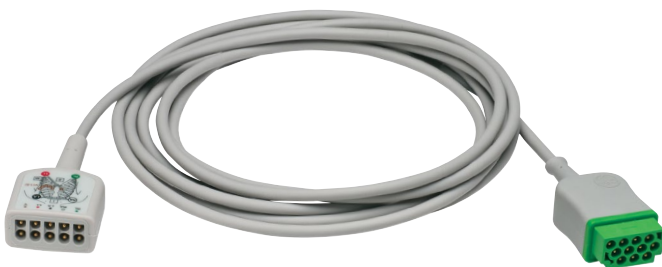
Reusable ECG Cable

Your facility has recently transitioned to the Multi-Link™ X2 ECG System from AirLife®. The green leadwires are disposable and travel with the patient. Remember to disconnect the leadwires from the gray cable when transferring the patient. The gray ECG cables are reusable and dedicated to the room. They should remain attached to the monitor.