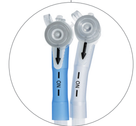
Clampless Y-connector offers scope and suction catheter access in either open or closed positions