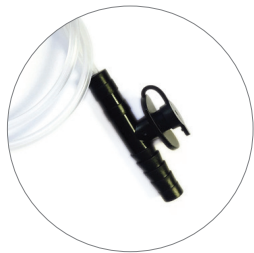
Low-friction suction catheters offer the ability to adjust suction pressure

The Salter Labs® Double Lumen Endobronchial Tube helps with easier and faster endobronchial intubation. Conveniently packaged assembled, the clampless system uses valves to easily isolate one lung ventilation or one lung isolation during surgery. Available in left- and right-sided versions in multiple sizes.