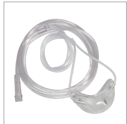
BiFlo™ Nasal Mask