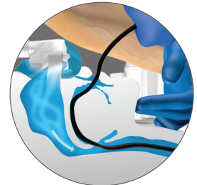
INTRA-OP Deep sedation and intra-oral