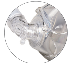
Mask not flexed