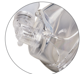
Mask when flexed