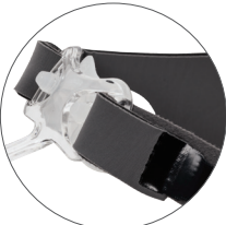
Adjustable forehead rest for comfort and stability