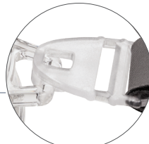
Quick-release clip eliminates the need to refit after removal